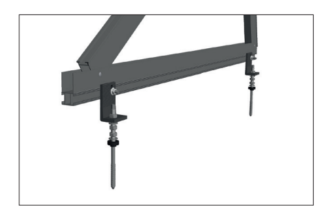
Adapter for hanger bolts